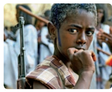
Child soldier, Sudan

Families are better able to provide for their children and stay together