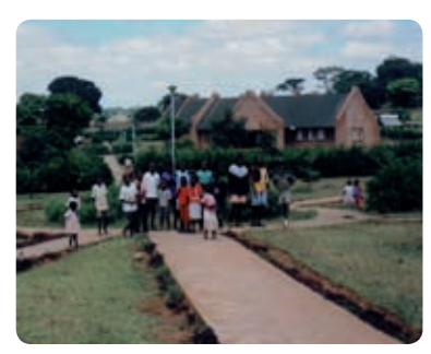
SOS Children's Village Lilongwe, Malawi