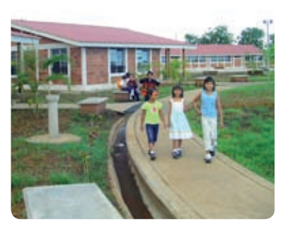
SOS Children's Village Leon, Nicaragua

The SOS Secondary School, Yantai, China is the largest we've built to date and was constructed in response to an urgent appeal from the provincial authorities in 1993.