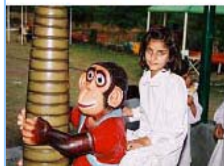
Enjoying the rides at Murree Theme Park