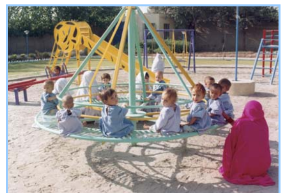
Children in an emergency shelter playground

The SOS 'search and rescue' team has located unaccompanied children who were orphaned or separated from their families on 8 th October. 187 unaccompanied children are currently in our care; SOS Children has been asked by the Pakistani government to care for all children left unaccompanied by the earthquake. Pakistani President Pervez Musharraf recently said in an interview that "SOS Children's Villages is the best custodian of our Kashmiri children" .